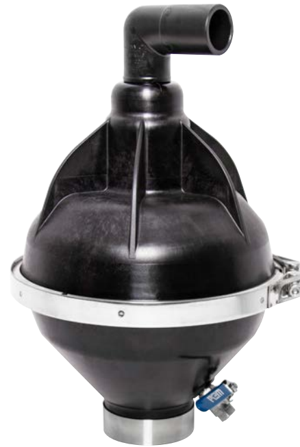
Air valve of plastic (Ord. No. 989-00)

The low weight of the air valve of PA allows an easy and quick installation. Moreover, via the profile clamp of stainless steel the valve can be quickly opened and closed in case of maintenance and/or cleaning.