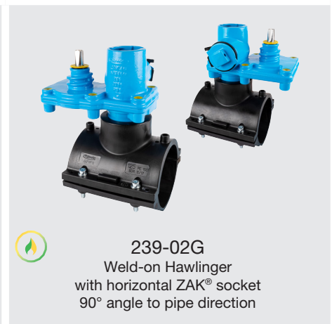
239-02G Weld-on Hawlinger with horizontal ZAK® socket 90° angle to pipe direction