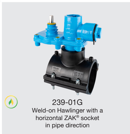
239-01G Weld-on Hawlinger with a horizontal ZAK® socket in pipe direction