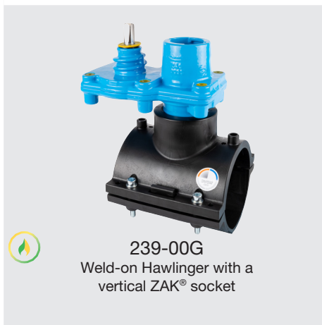
239-00G Weld-on Hawlinger with a vertical ZAK® socket