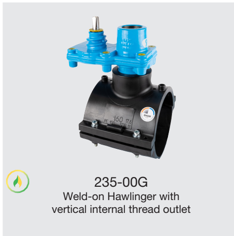
235-00G Weld-on Hawlinger with vertical internal thread outlet