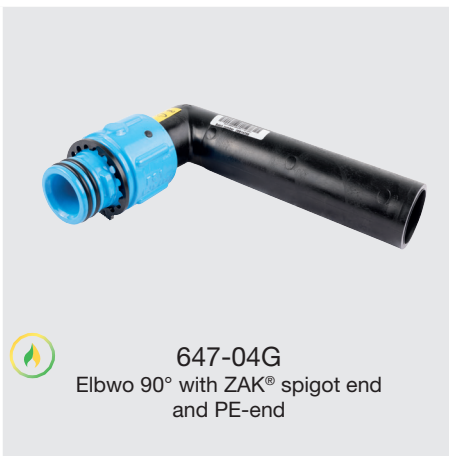
647-04G Elbow 90° with ZAK® spigot end and PE-end