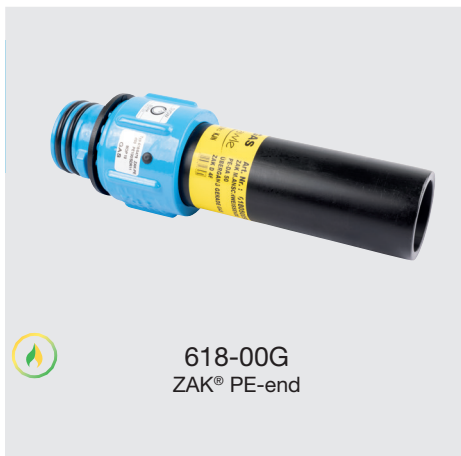
618-00G ZAK® PE-end