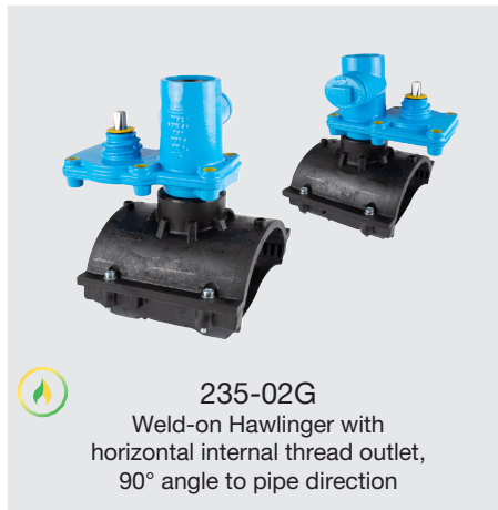
235-02G Weld-on Hawlinger with horizontal internal thread outlet, 90° angle to pipe direction