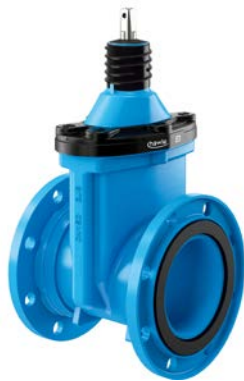
Order No. 411-00