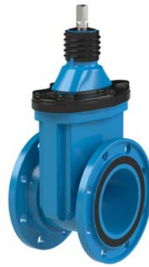
Order No. 412-00