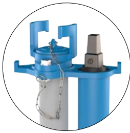
Pushed-on CI cover