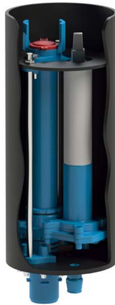
BAIO® spigot end DN 80