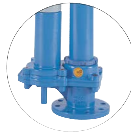
Flange connection DN 80