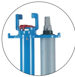
Plastic claw cover