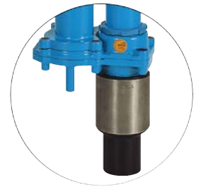
PE-tail d 90/d110