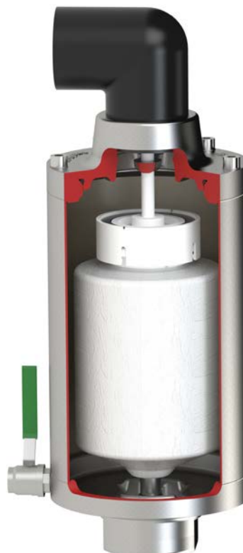
Version with female thread