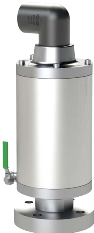
Version with flange