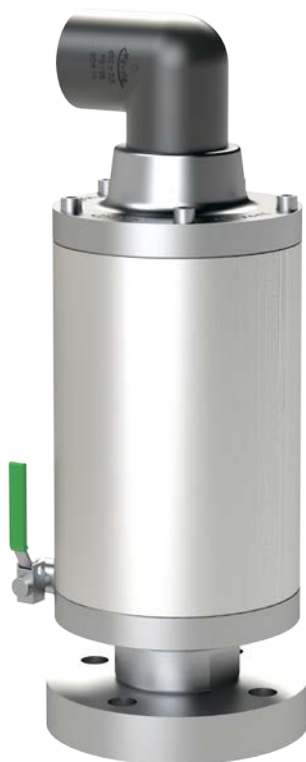
Version with flange