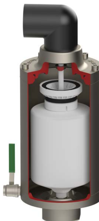
Version with female thread